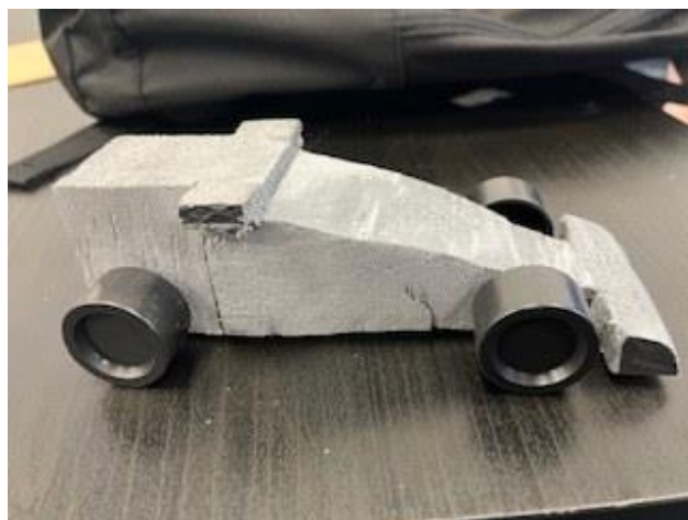
1 - THE FASTEST CAR ON THE TRACK!